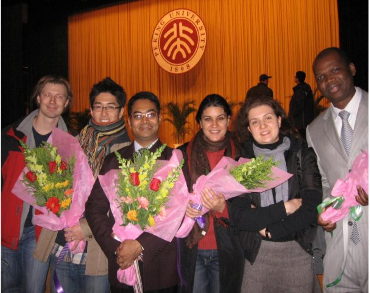
Academic Excellence Award Ceremony, 12 December 2008, Centennial Memorial Hall, Peking University, Beijing China