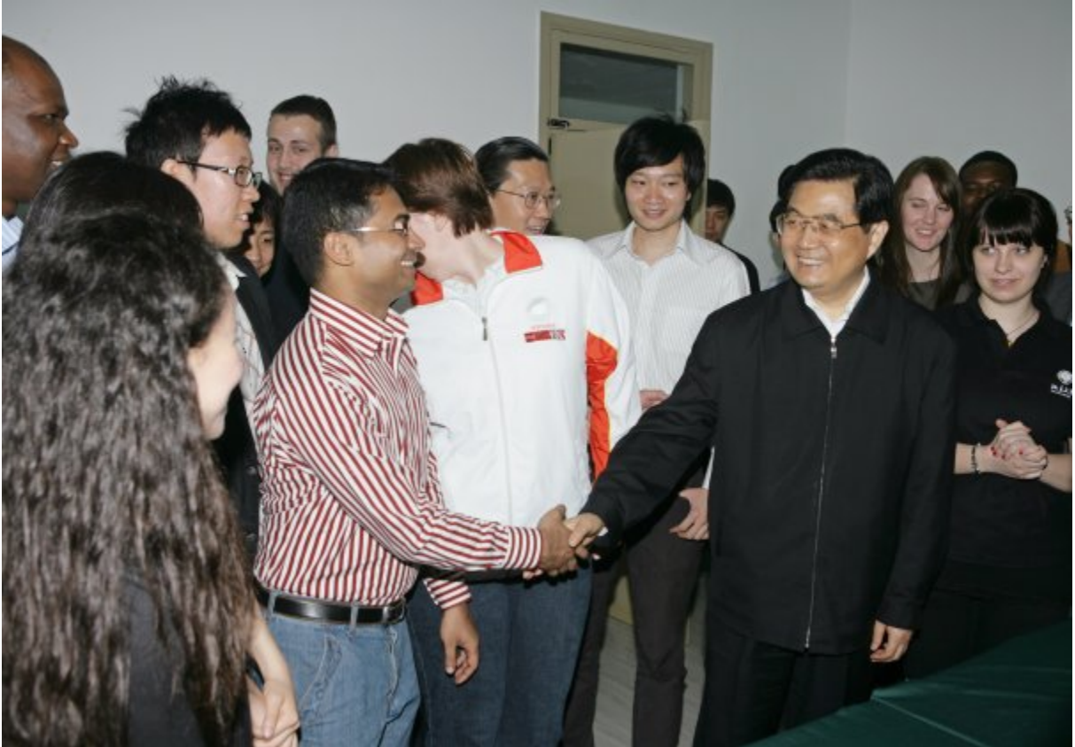
Meeting Chinese President Hu Jintao