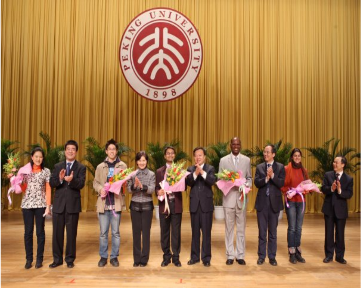
Academic Excellence Award Ceremony, 12 December 2008, Centennial Memorial Hall, Peking University, Beijing China